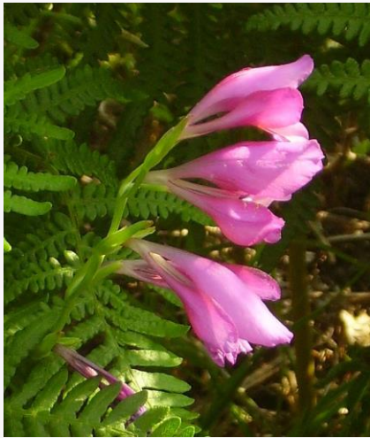
1/3 of British wildflower species