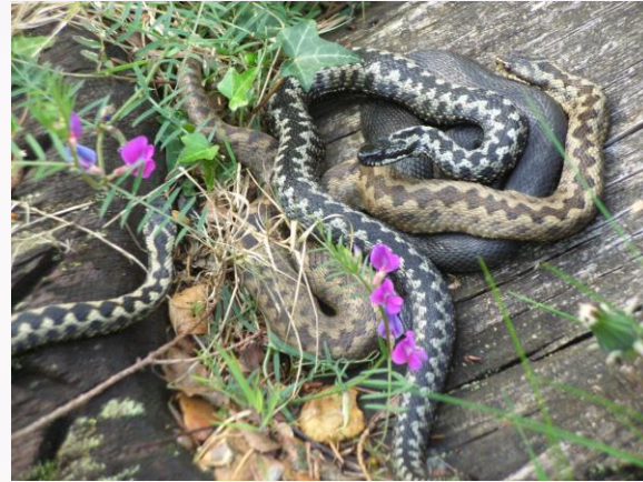
All 6 UK native reptile species