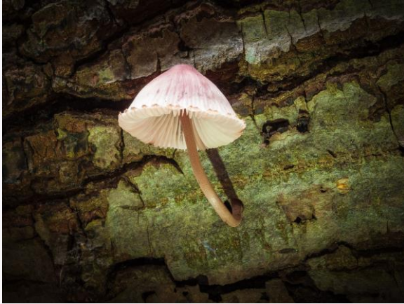
2,600 fungi species