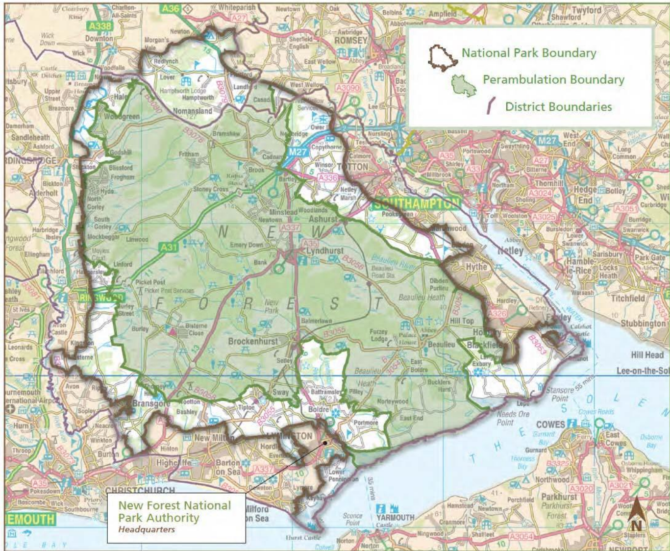
Not to Scale, © Crown Copyright. All rights reserved New Forest National Park Authority Licence number 1000114703, 2013.