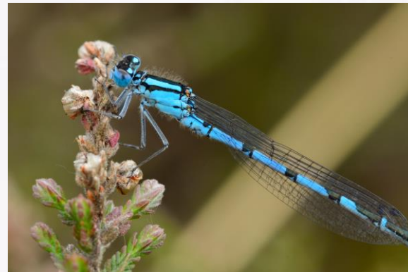
74% of all British dragonfly & damselfly species