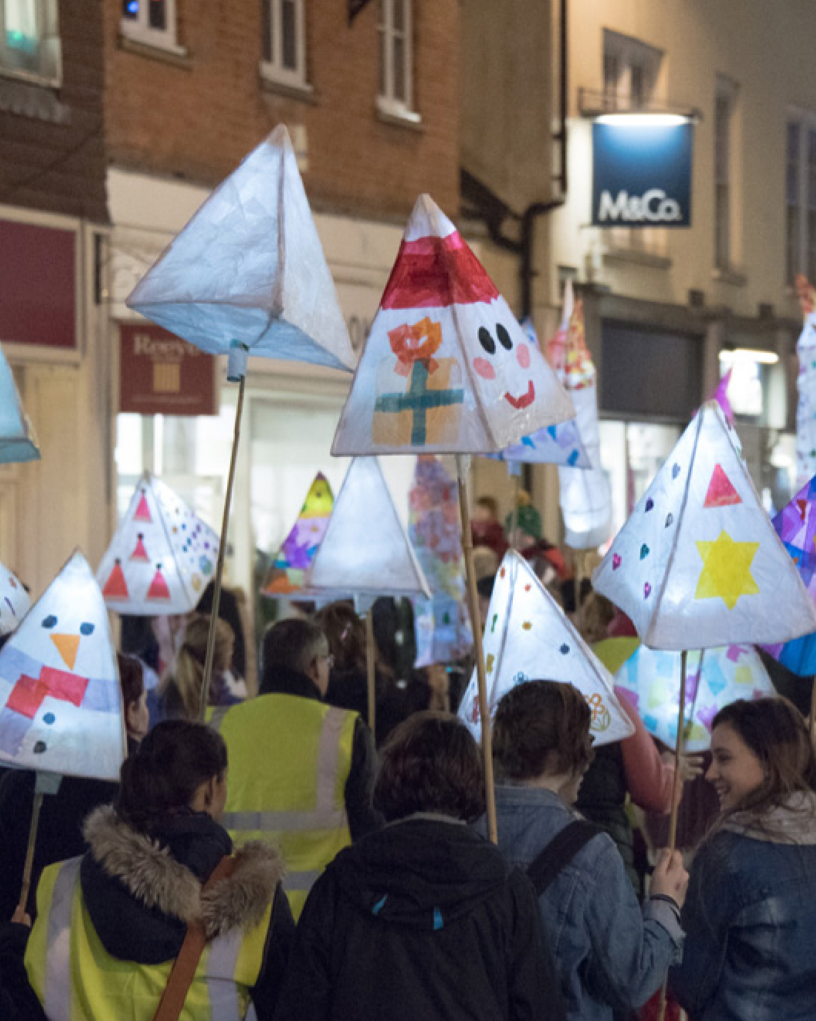
Romsey Lantern Parade